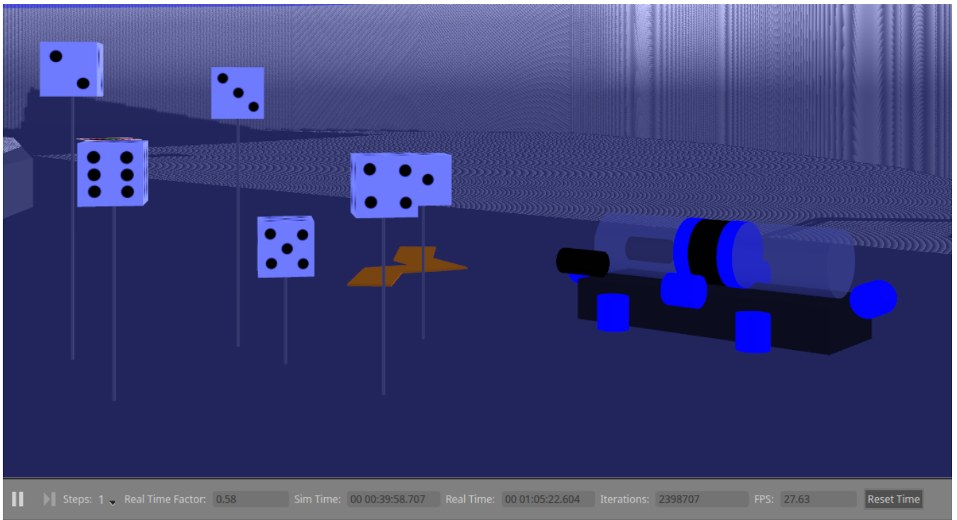
The sub in simulated environment.

The algorithm works by detecting features (such as edges and corners) in an image, and locates them in space using triangulation with other known map points.